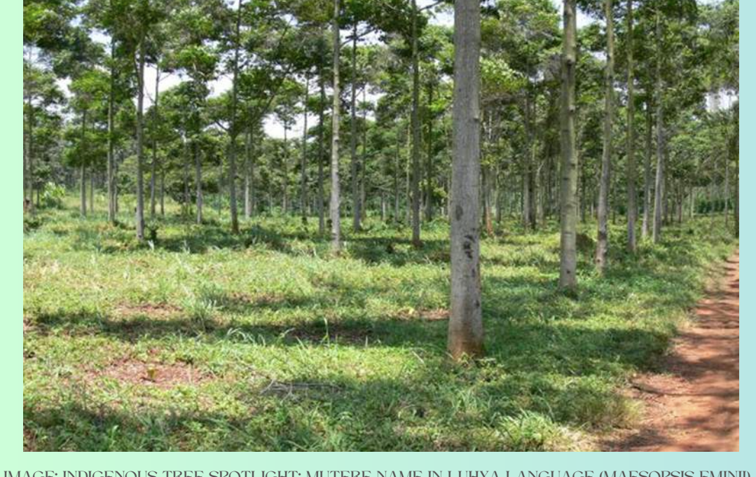
IMAGE: INDIGENOUS TREE SPOTLIGHT: MUTERE NAME IN LUHYA LANGUAGE (MAESOPSIS EMINII), IS FOUND IN KENYA (2023 AT LUCINDACENTRAL.ORG/PHOTO BY ENDRE HANSEN)

If both parents actively engage in parenting, they create a conducive psychological atmosphere for their children. Children who will freely express themselves. These are children who have the courage to pursue their dreams. All this is possible since fathers too play a crucial role in parenting and can regain the hearts.